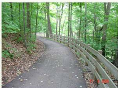
Typical asphalt trail