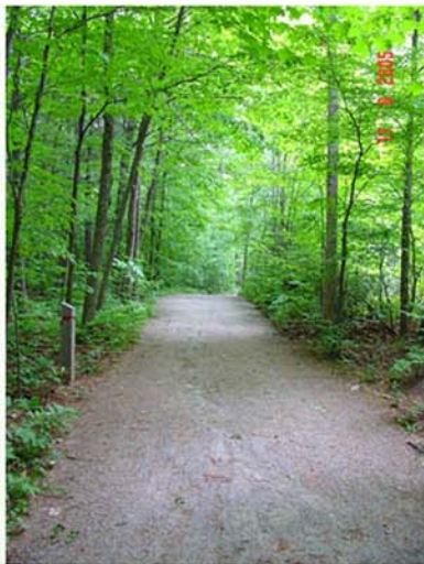
Typical limestone trail