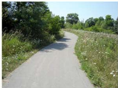
Typical asphalt trail